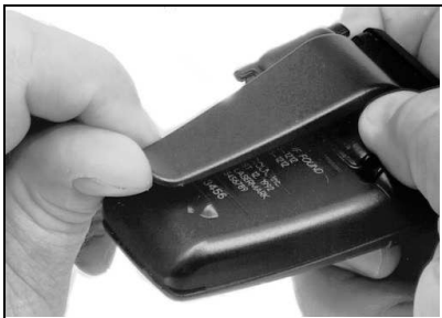
Opening the battery cover.